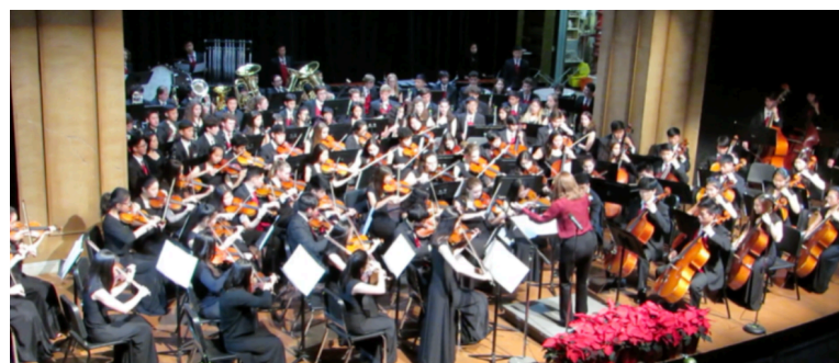
Our Advanced Orchestra